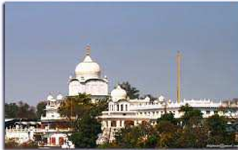
Gurudwara Sri Paonta Sahib, India.

The Gurudwara of Paonta Sahib of the tenth Guru, Guru Govind Singh ji, holds very high historic and religious importance among Sikhs. Surrounded by lush green forest of saal trees, Paonta Sahib also attracts tourist for its scenic beauty and the majestic view of gushing Yamuna River.